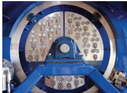
IWOCS Reels exterior gauges and valves