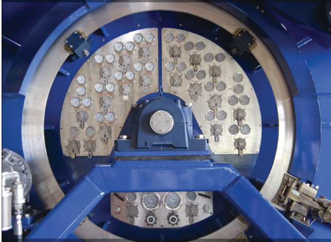
IWOCS Reels exterior gauges and valves